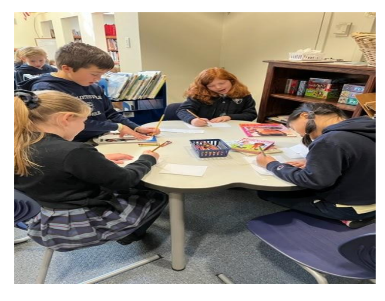
table of contents and index of our dinosaur books.

We will be hosting a Book fair in May. Please consider volunteering for this important library event. There will be a sign-up genius that will soon be posted. I don't have a chairperson for the event yet. If you would like to volunteer please send me an email!